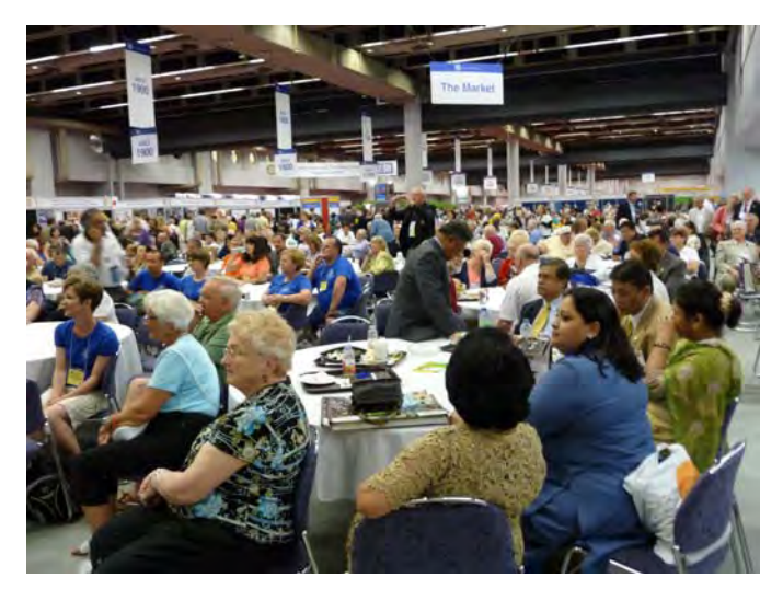
Inducting new members