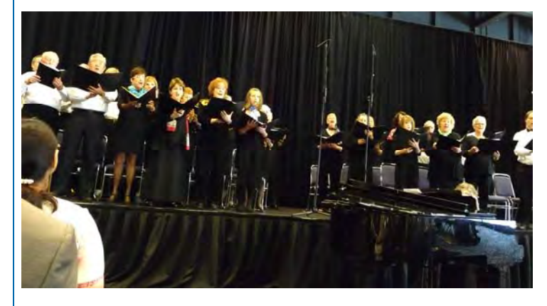
The IFRM booth....membership and sing-alongs