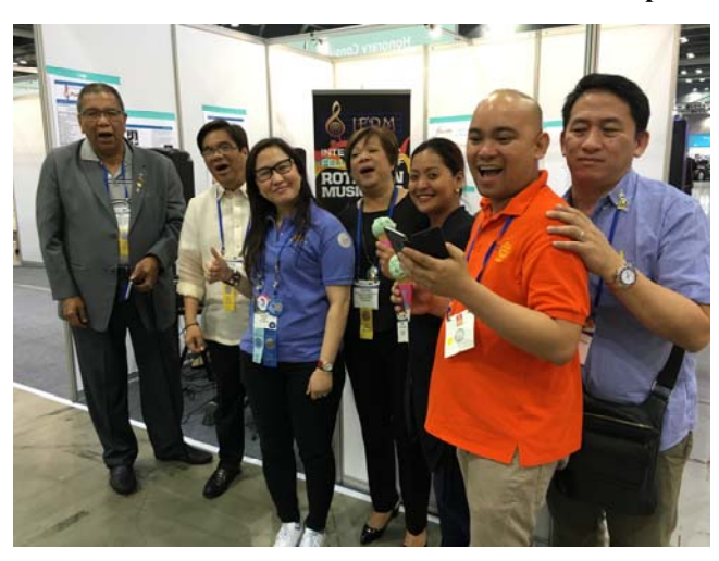
New IFRMers from the Philippines