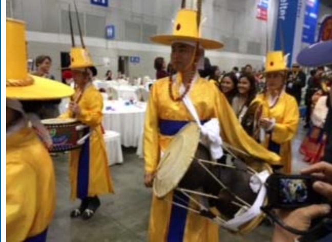
Not all the music came from the IFRM Booth!