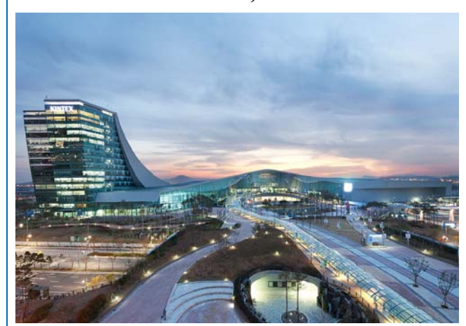
Kintex Center, Home of RI Convention in Seoul