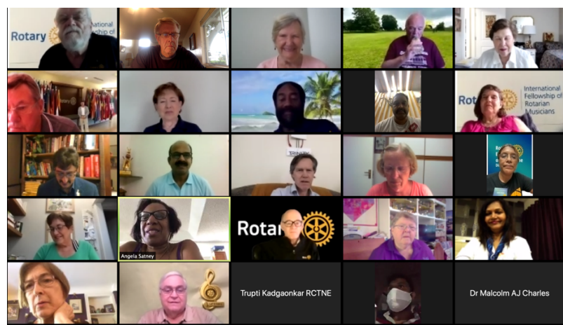
Screen Shot from IFRM Sings